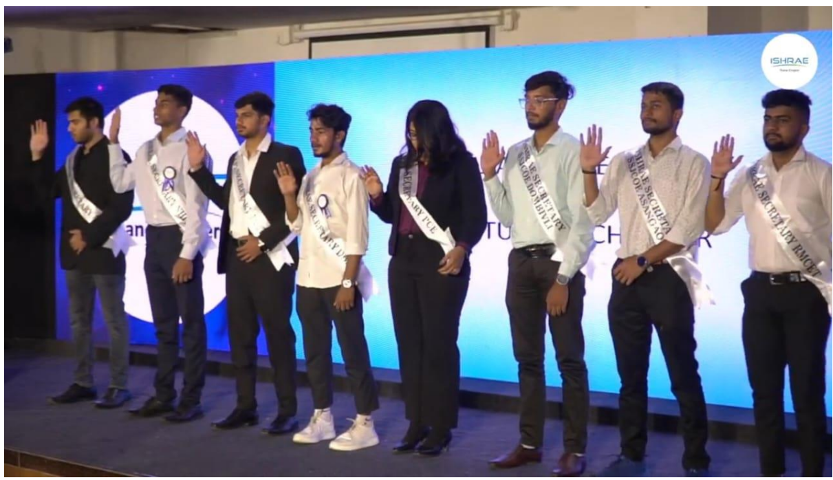
Secretaries taking oath